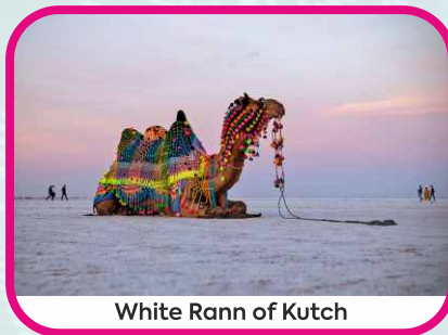
White Rann of Kutch