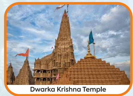
Dwarka Krishna Temple