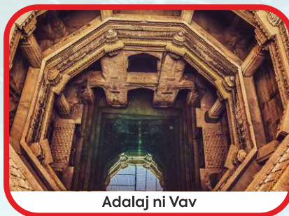
Adalaj ni Vav