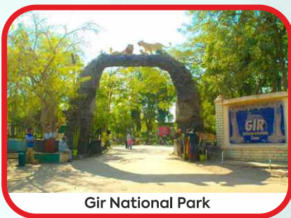
Gir National Park