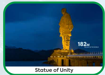
Statue of Unity