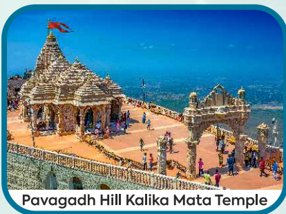
Pavagadh Hill Kalika Mata Temple