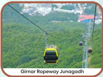
Girnar Ropeway Junagadh